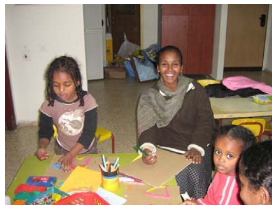
Enrichment Playroom – linguistic enrichment