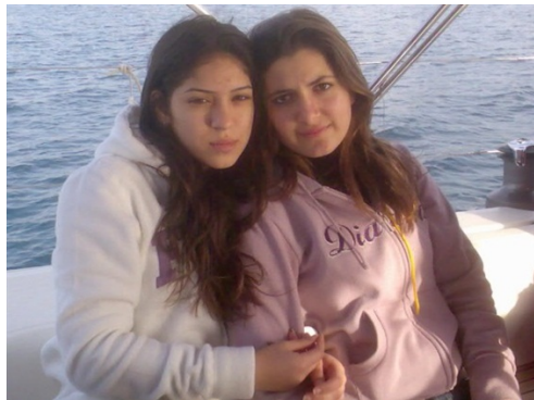
NOVA participants during workshop