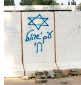
Photograph from 2009 SderotYouth.com exhibit