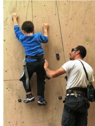
(photo at right – the climbing wall at Sderot's Extreme Sports Center)

After moving to a new and larger building at the end of 2008, in 2009 the Tachlit-Meir Center was able to increase enrollment by 50% to meet increased need following Operation Cast Lead. (There is still a waiting list for placement.) The Center is now officially partnering with Sderot's municipal Social Welfare Services to improve resources and response for teens at high risk.