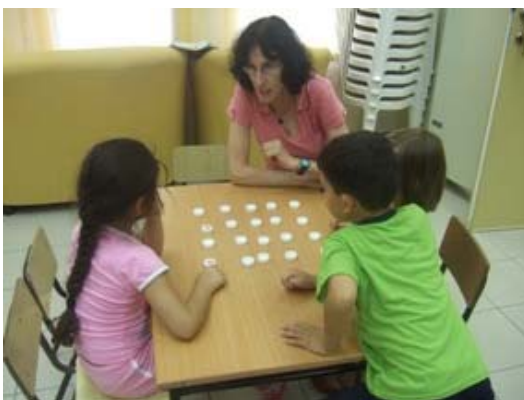
Safe Passage – preparing for first grade

In 2009, Gvanim founded a regional project for developing early childhood services. The project was established with the financial support of The Schusterman Family Foundation-Israel, and is a national model for regional cooperation. Gvanim was also a partner in creating the national forum for Early Childhood Centers; the forum provides opportunities for shared learning and cooperation with government ministries. Another highlight of 2009 was the establishment of Sderot’s “Open House;” the Open House is located in a WIZO pre-school center and is run in partnership with WIZO; it provides a variety of services for early childhood professionals, parents and children.