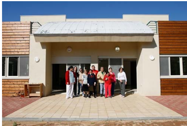
Residents outside the new Supported Housing Complex in Kibbutz Migvan